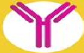
Monoclonal antibodies (mAbs)