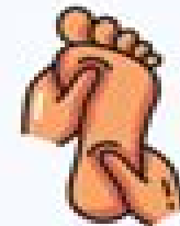
Pressure point therapies (e.g. Reflexology)