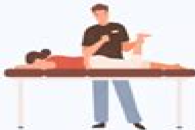
Structural bodywork (e.g. Chiropractic)