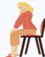
Movement therapies (e.g. Alexander technique)