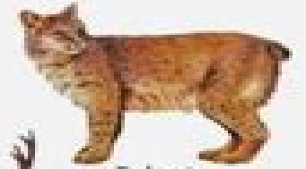
Bobcat Lynx rufus To 4 ft. (1.2 m)