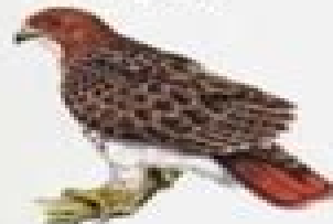
Red-tailed Hawk Buteo jamaicensis To 25 in. (63 cm)