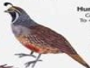
California Quail Callipepla californica To 10 in. (25 cm)