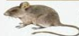
California Mouse Peromyscus californicus To 8 in. (20 cm)