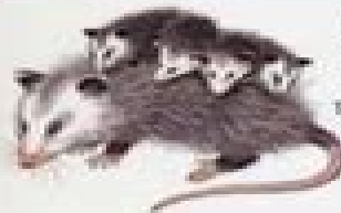
Virginia Opossum Didelphis virginiana To 40 in. (1 m)