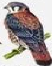
American Kestrel Falco sparverius To 12 in. (30 cm)