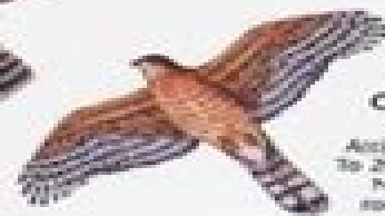
Cooper's Hawk Accipiter cooperii To 20 in. (50 cm) Note long, rounded tail.