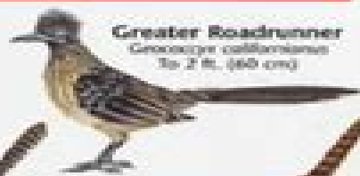
Greater Roadrunner Geococcyx californianus To 2 ft. (60 cm)