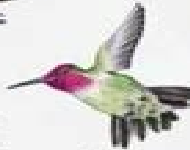
Anna's Hummingbird Calypte anna To 4 in. (10 cm)