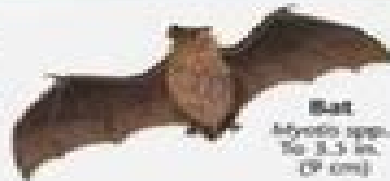
Bat Myotis spp. To 3.3 in. (9 cm)