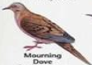
Mourning Dove Zenaidura macroura To 13 in. (33 cm)