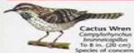
Cactus Wren Campylorhynchus brunneicapillus To 8 in. (20 cm) Species of concern.