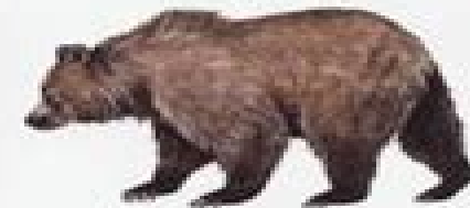
California Grizzly Bear Ursus californicus To 9 ft. (2.7 m) Extinct.