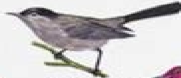
California Gnatcatcher Psaltriparus californicus To 4 in. (10 cm) Threatened species.