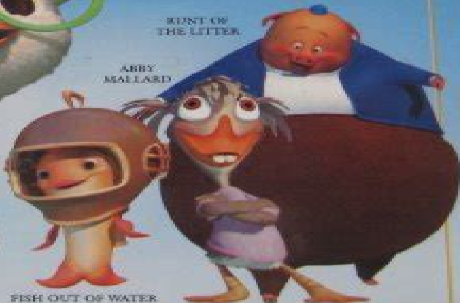
FISH OUT OF WATER