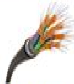
Fiber Optic Cables