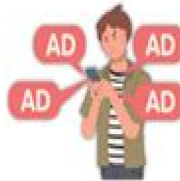
Online pop-up ads