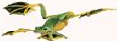
Wallace's Flying Frog