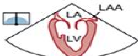
Two chamber: 90°