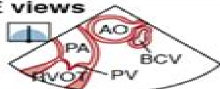
Aortic arch SAX: 90°