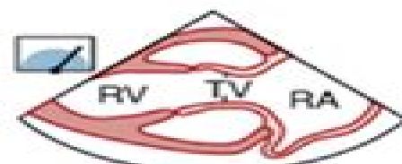
Rt. ventr inflow: 120°