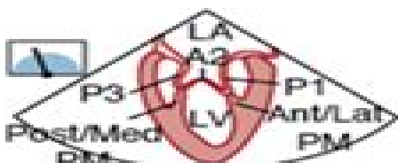
Mitral commissural: 60°