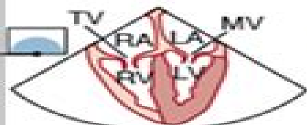
Four chamber: 0°