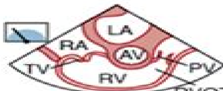
Rt ventr inflow/outflow: 70°