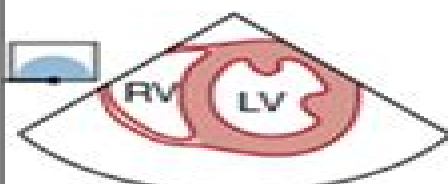
Mid SAX: 0°