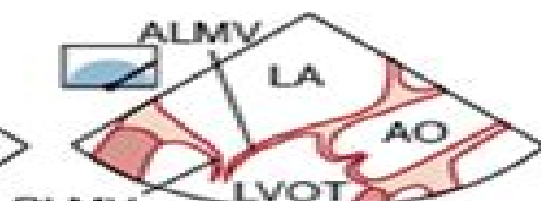
AV LAX: 120°