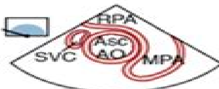
Ascending aorta SAX: 30°