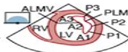
Basal SAX: 0°