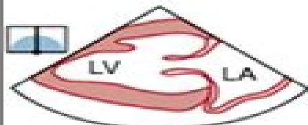
Two chamber: 90°