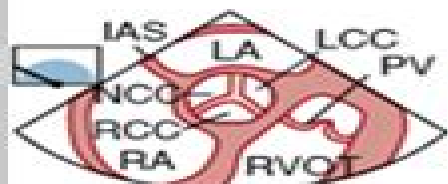
AV SAX: 40°