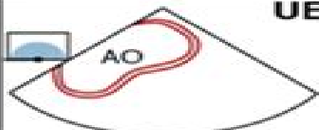
Aortic arch LAX: 0°