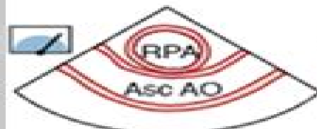
Ascending aorta LAX: 110°