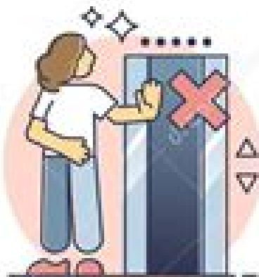
DON'T TAKE ELEVATORS