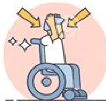
PROTECT YOUR HEAD