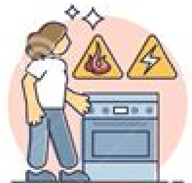
TURN OFF GAS AND ELECTRICITY