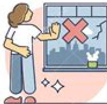
STAY AWAY FROM WINDOWS AND ANYTHING THAT CAN FALL