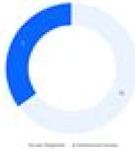
Workload Distribution Across Teams