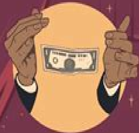
The Levitating Dollar