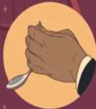
The Spoon Bend