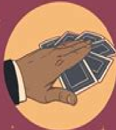
The Magnetic Hand