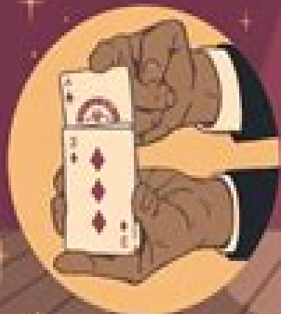
The Rising Card