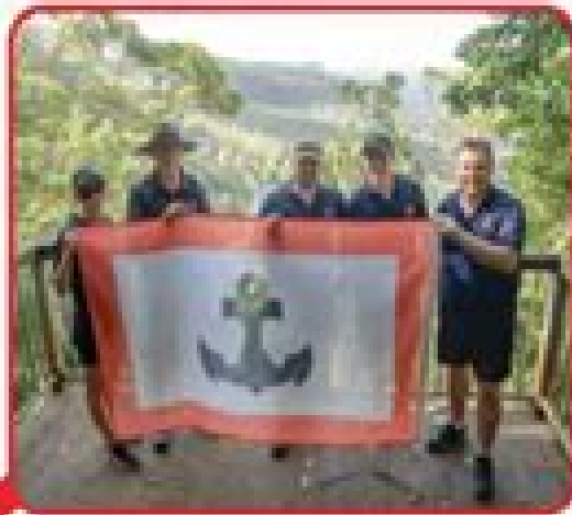
Mt. Tamborine, Queensland - Dec 13, 2024

Celebrating two centuries of history as our flag journeys through the Asia-Pacific region, honoring our legacy and network