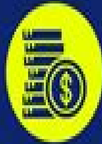
The Economic Model