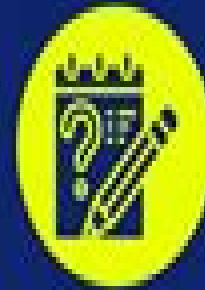
The Learning Model