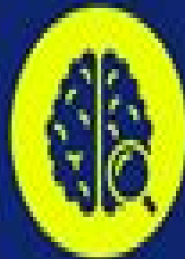
The Psychoanalytic Model