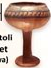
Navdatoli Goblet (Malwa)