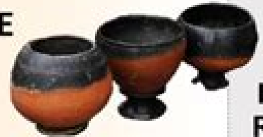
Black & Redware (1500-800)