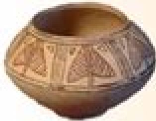
Hakra ware (3300-2800BCE)