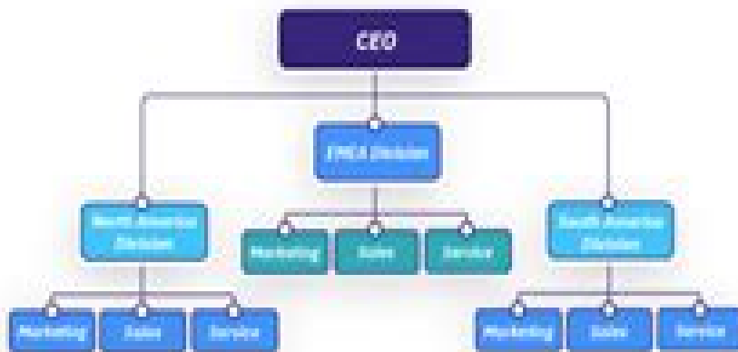
3. Geography-Based Organizational Design