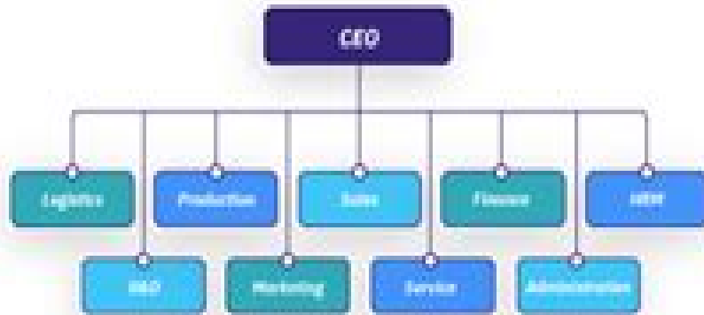
1. Functional Organizational Design