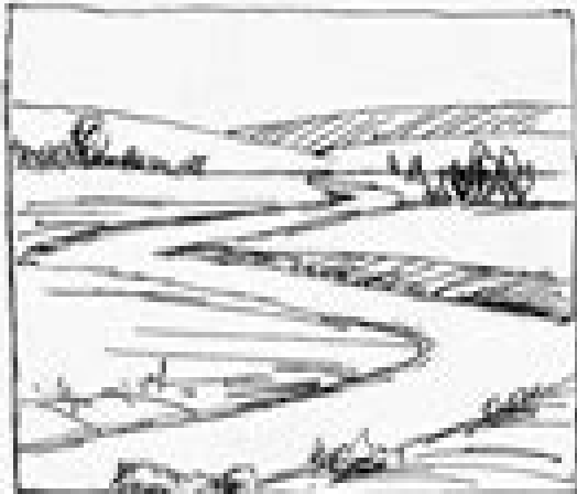
"S" or Compound Curve.