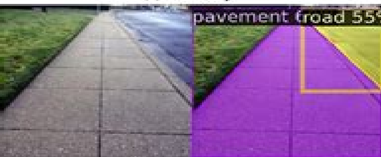
(c) "pavement", "road"