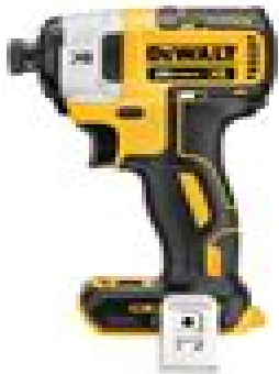
Cordless impact driver