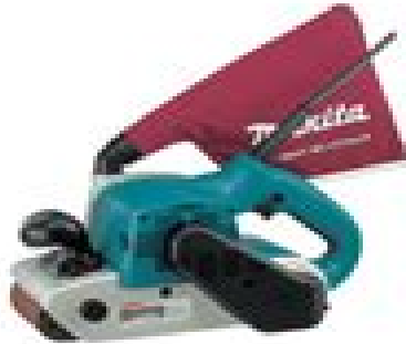
Cordless belt sander