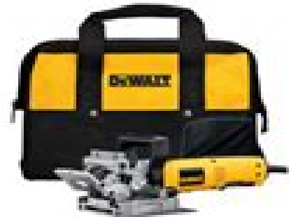
cordless biscuit joiner