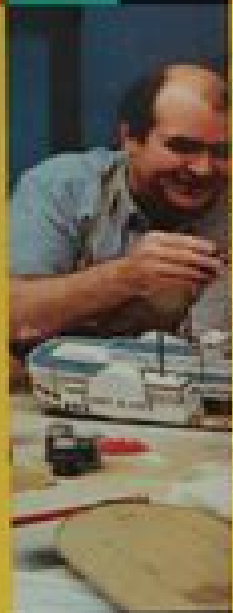
A Video Guide To Model Building

Includes four complete half-hour shows. Description on back of package.