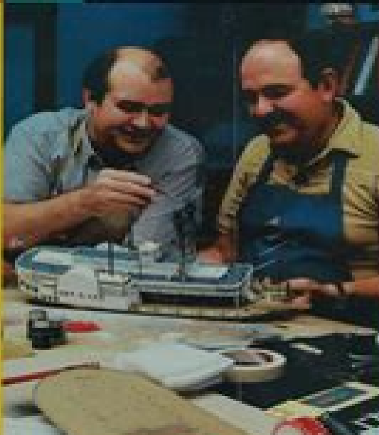
A Video Guide To Model Building

Includes four complete half-hour shows. Description on back of package.